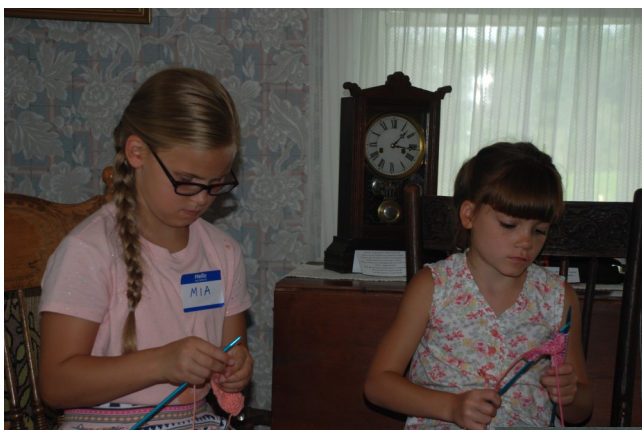
Children's Fiber Arts Faire—August 15 - Classes in knitting, crocheting, and weaving (23 students) (Sponsored by Stewart's Shops)