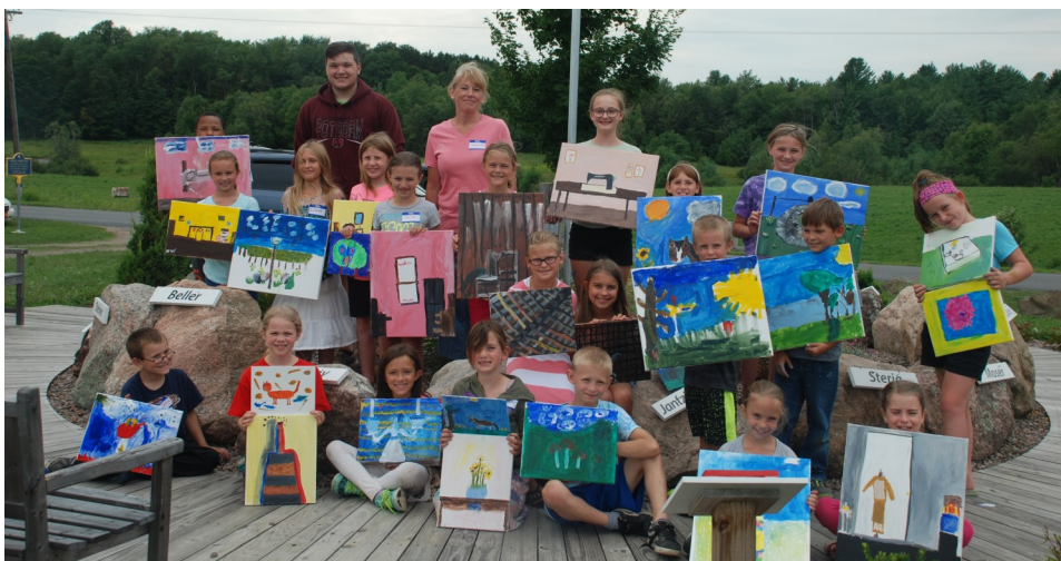
Children's Fine Arts Faire— August 1—Class of 22 painted an impressionable scene from the Heritage Farm.